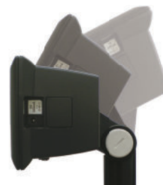
Tilting indicator bracket