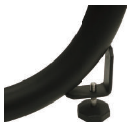
Additional pole-support foot