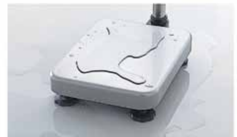
IP65 with SUS304

*1 Permits no ingress of dust and withstands water jetting from any direction.